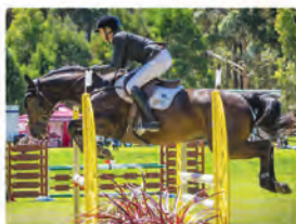
Oaks Quickstep (Quintender)