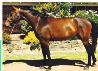
Colmay Sire : Colman Rising 4 Year Old