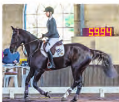
Bellucci (Balou Du Rouet)

Steinhart Annabel (Ahorn/Lord) - Kanndarco (Kannan/Darco)