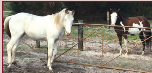
Two happy stallions paddocked by each other.

The horses are also paddocked next to each other with a one metre lane between, but they don't behave aggressively toward each other – no rivalry, no charging the fences.