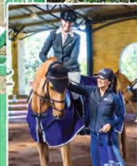
Caprino 2017 4 Year Old Young Horse Champion

West Coast EQUITEC Vets Performance Products