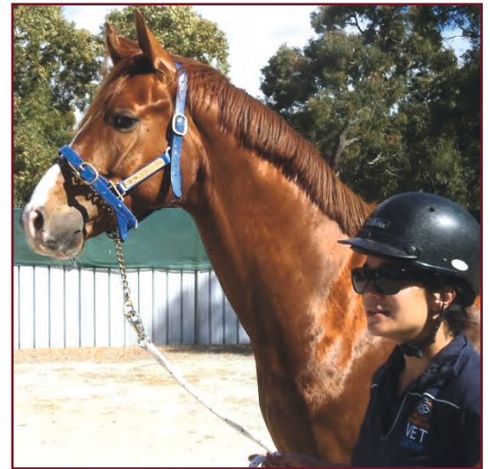
Latin Lover at Valley Equine ready to collect.