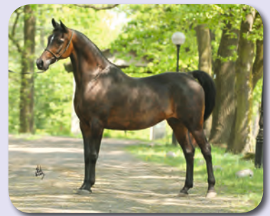
The beautiful mare Elwira

Alphalea will also be standing the chestnut stallion, Status LL, by the renowned sire Marwan Al Shaqab, so be prepared to see some stunning progeny on the ground by these two stallions next year.