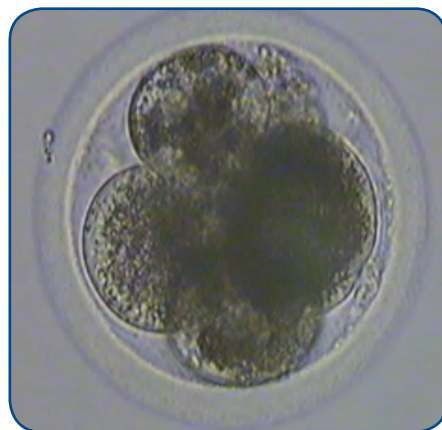
Embryo at 66 hours

There is much work that yet needs to be done to develop this market. The streamlining of techniques to improve the reliability of success to satisfy the expectation of the consumer is just one aspect. Currently the importation of equine embryos is not allowed in Australia, and protocols and laws need to be developed in order to make this possible. Perhaps this will see the development of quarantine stations for oocyte donor mares just as those that exist for stallions? Time will tell, and I for one find it an exciting and promising idea!