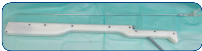
Trans-vaginal ultrasound probe and needle

The international trade of semen from stallions selected for their bloodline, performance or type is the most affordable way breeders across the world have been able to 'upgrade' their breeding programs. This market will remain influential and important, however there is something new on the horizon. The sale and international transport of frozen equine embryos is now a real possibility with the continuing improvements in modern reproduction techniques.