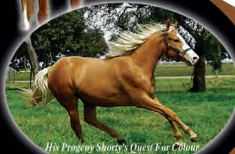
His Progeny Shorty's Quest For Colour